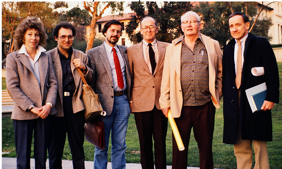
The Robinson Jeffers Association Conference at Occidental College, 1985