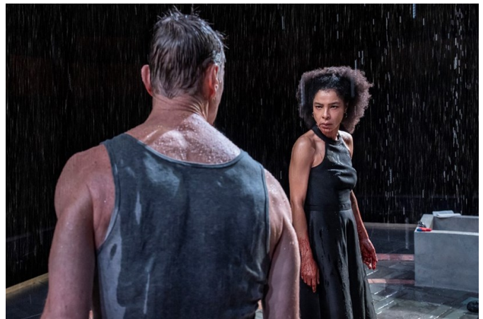
Medea and Men