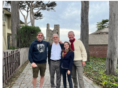
New Tor House Docents

Jeffers family experience. Our new docents are welcomed from a wide range of backgrounds, and each has the opportunity to craft their own customized storytelling experience.