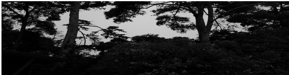
Carmel at Noon on September 9, 2020. Where it is gray imagine the orange of surrounding fires.

Tiny sear of fluorescent fire on the dune apricot melds into gold fades into scarlet each alive in the eye at the same moment what's needed to light its fuse the mellow candle glow of a medium sized star 93 million miles away-- any closer and as the sea dries up this tiny blossom shrivels further out and this frail little gem light sparkles just once then dies in a darkening world.